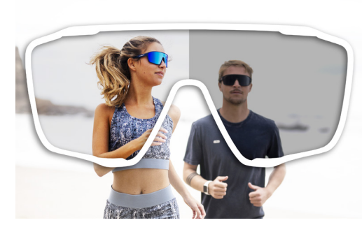
FOR CONTRAST, SHARPNESS AND BRILLIANCE