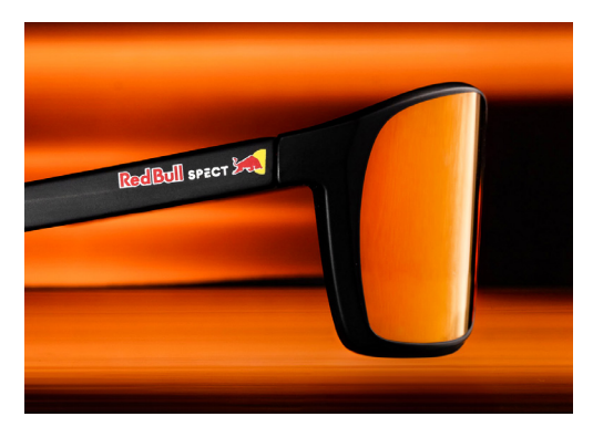
SMOOTH TRANSITION FROM LENSE TO FRAME