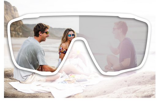
FOR A GLARE-FREE VISION