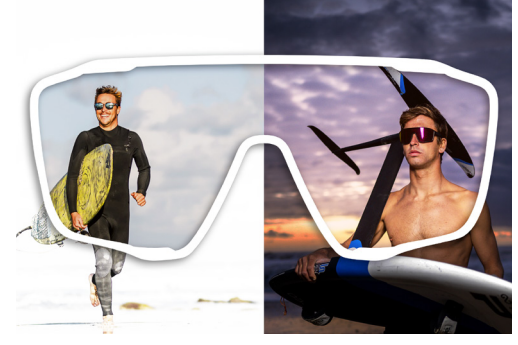
ADAPTS TO LIGHT CONDITIONS