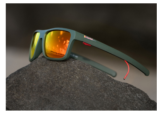
ADDITIONAL TEMPLE FOR A SECURE AND FIRM FIT