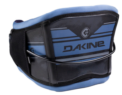
FLORIDA BLUE DKK-KHAC2H